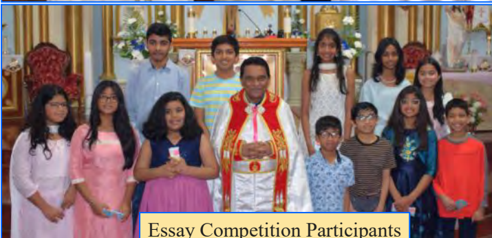
Essay Competition Participants