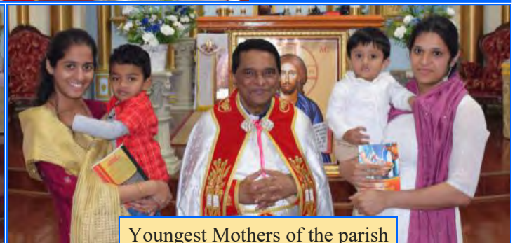
Youngest Mothers of the parish