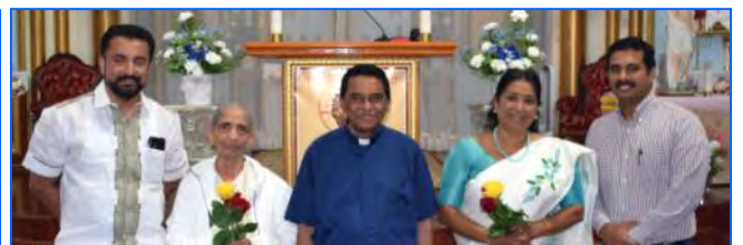
Oldest and youngest Grandmas with coordinators