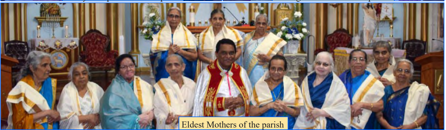
Eldest Mothers of the parish