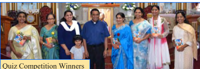
Quiz Competition Winners