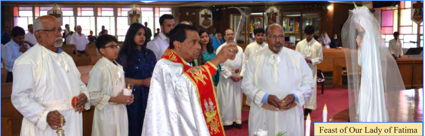
Feast of Our Lady of Fatima