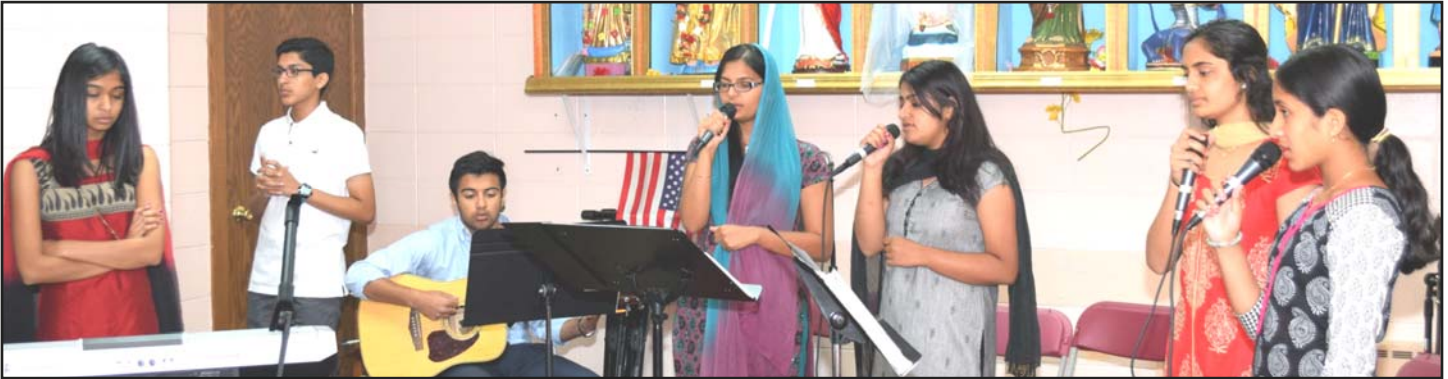
Youth Choir of our parish.

611 Maple Street, Maywood, IL 60153 www.shkcp parish.us | mutholath2000@gmail.com | 773-412-6254