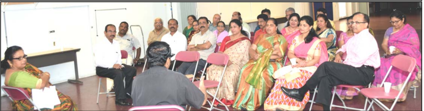
Planning on Tour to Branson, Missouri to view the Moses Show and Chinese Show on Friday and Saturday.