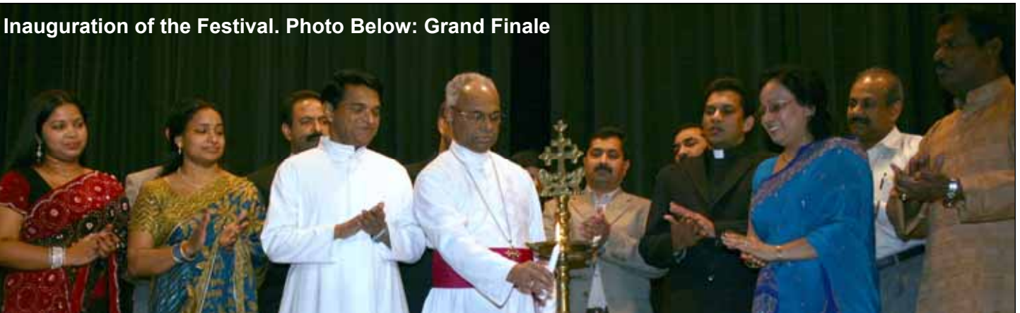
Inauguration of the Festival. Photo Below: Grand Finale