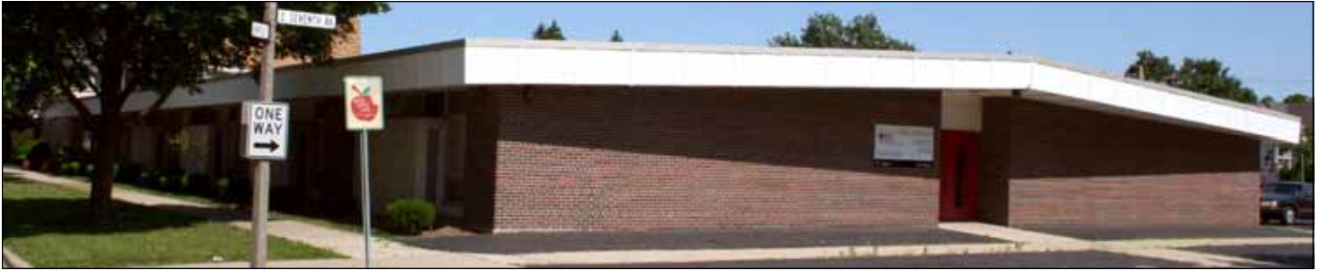
Our present school building that can be converted as our Youth Center

We have an opportunity to redesign our Youth Center Project to be cost effective, easily accessible, and professional looking. The reason for planning the youth center on the top of the present school was because of our long term contract with Catholic Charities to run their Early Childhood Day Care Center that is beneficial to the local community. That center is functioning without summer break. So we had to think of not disturbing them with our construction work. The estimated cost of the youth center came out to be around one million for the basic structure and an additional 0.75 million for the completion of the project.