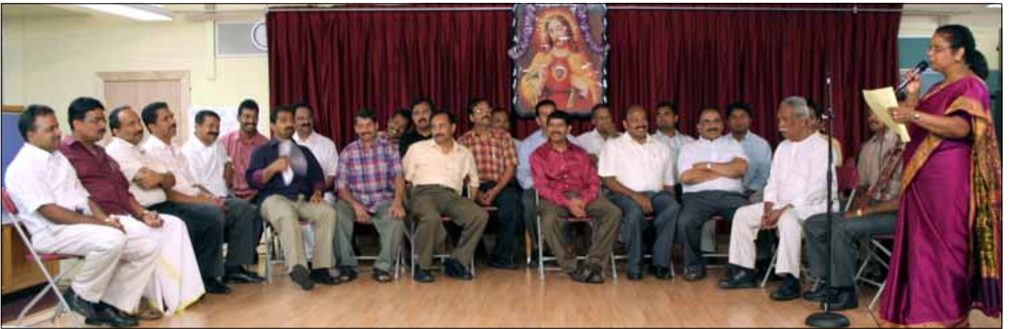
Contest to select the best father from our parish.