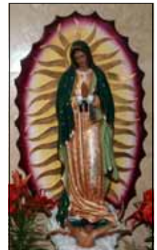
- ഒരു വിശ്വാസി