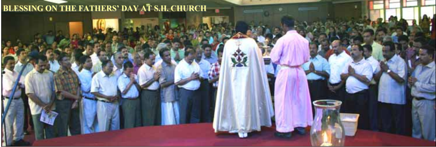
BLESSING ON THE FATHERS' DAY AT S.H. CHURCH