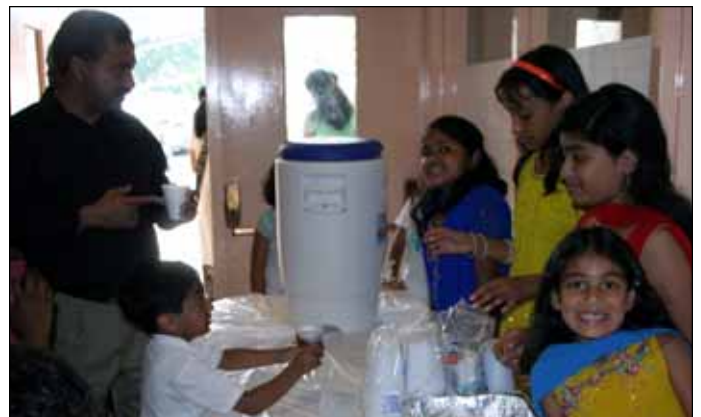
Agape Lemonade sales for charity by children. They raised $102.90 last Sunday.