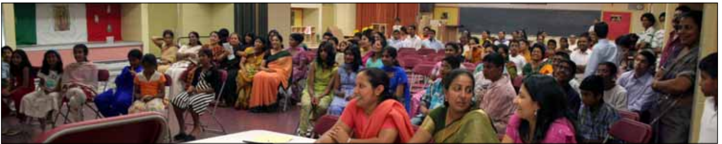
Observers of the "Best Father" Contest.