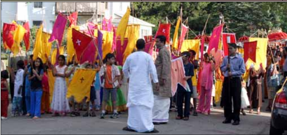
PHOTOS: Various Scenes of the procession.