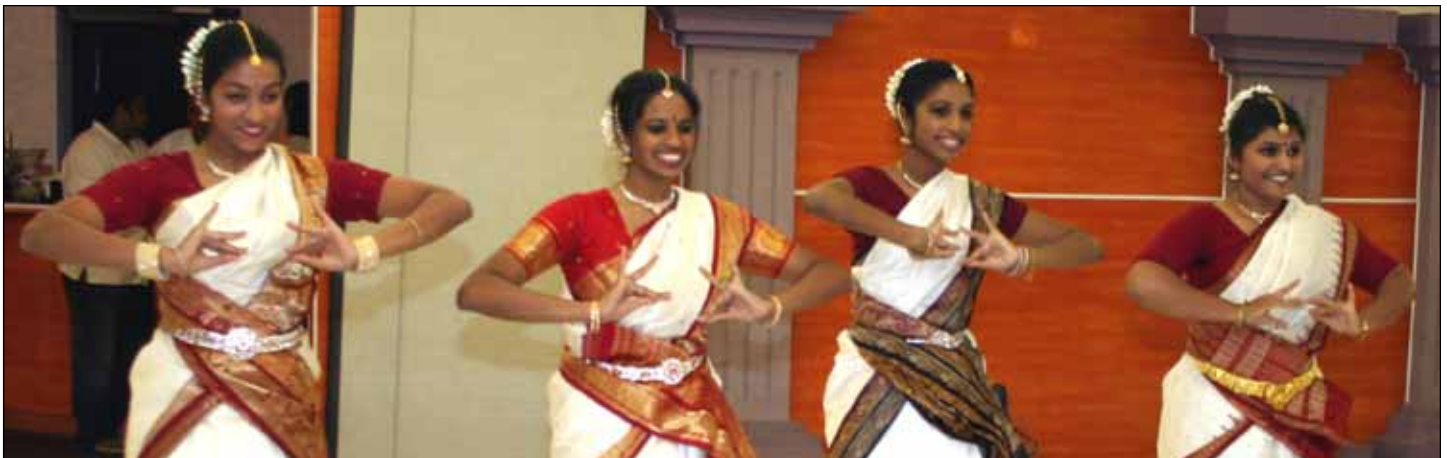
Dance at the Banquet honoring the three Archbishops and bishops