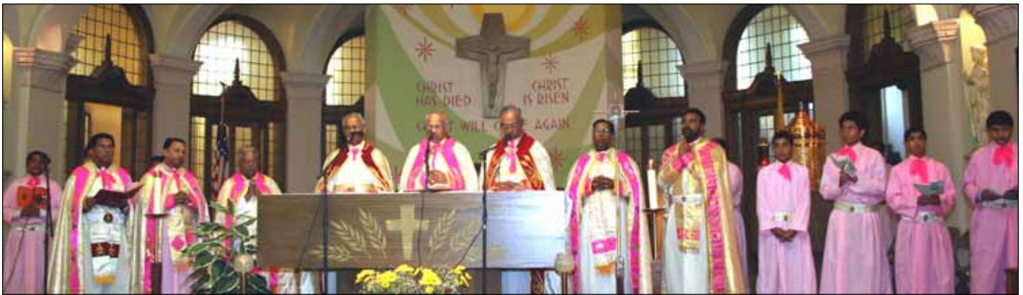
Holy Mass at OLV Chicago on Sunday July 16th