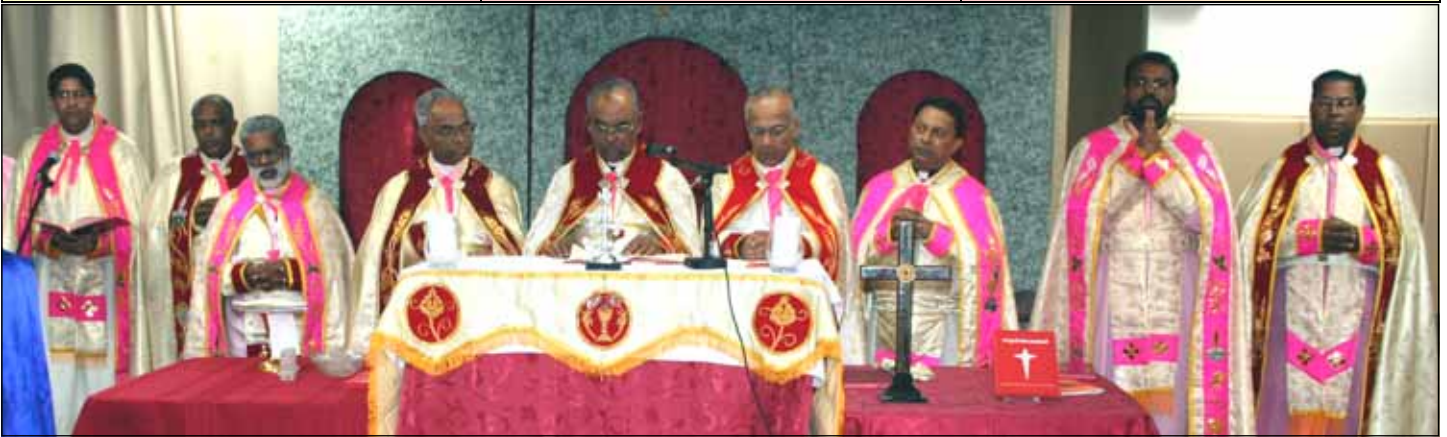
Holy Mass at Addison on July 15th celebrating the feast of Mar Kuriakose Kunnacherry