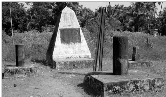
The remains of King Cheraman Perumal's palace at present at Kodungalloor preserved by the government.

The Southists among St. Thomas Christians of Malabar trace their origin to the tribe of Judah of Israel. Their history starts particularly from the fourth century when they arrived at Cranganore in 345 AD, under the leadership of Knai Thomman. All these are mere surmises chiefly got from the tradition alone. Very few written records are with us, which also do not help us to reach to a conclusive conclusion. At any rate, we are quiet sure of their existence as a separate ethnic community at least from the 15th century. Several European as well as native writers testify to this fact. Hence even if we forget the whole past, at least from the 15th century they have their own independent existence which we have to admit and admire.