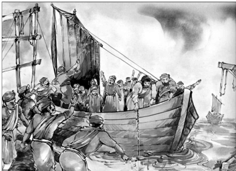
The migration to Kodungalloor under the leadership of Thomas of Kinai and Bishop Joseph of Urha.

They were also known as Ancharappallikkar because they had five churches of their own, namely Diamper, Kaduthuruthy, Kottayam, Chunkom and Kallissery. They had half privilege in all other churches