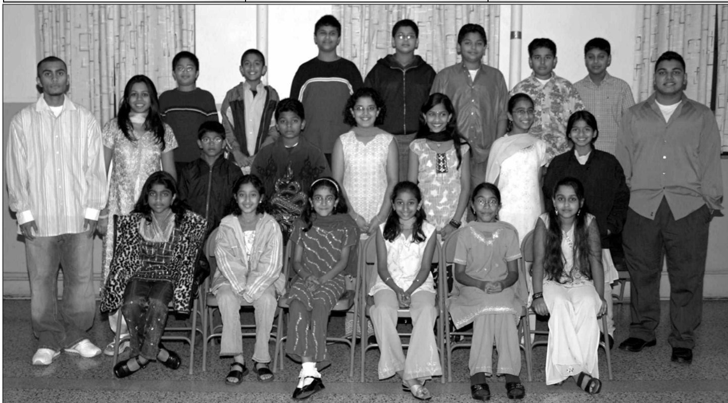
Students and teachers of Fifth Grade in the Religious Education School at OLV Chicago.